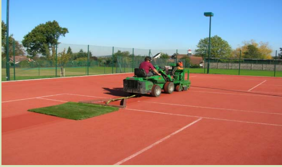
Towable Artificial Grass Drag Mat