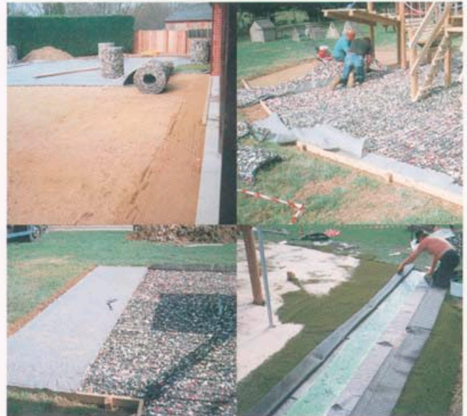
Clockwise from top left: 1. preparing the base and laying the base layers. 2. finishing base layers. 3. laying second layer. 4. laying carpet.

Dimensions The base layers of ProPlay polyethylene sheets are 0.95 m wide x 2.25 m long and 25 mm or 35 mm thick. The ProPlay rolls are 1 m x 10 m long and 25 mm or 35 mm thick. The synthetic carpet is 4.0 m wide x 25 mm long.