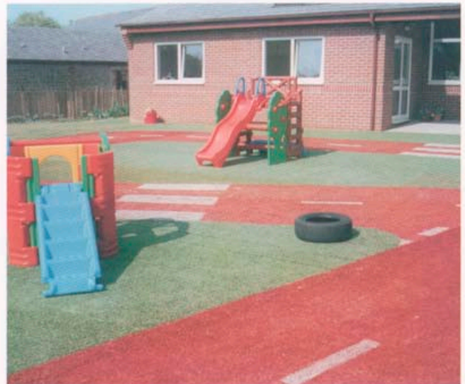
The completed playground surfacing

Appearance The visible surface of the cutpile carpet is normally green, but red and blue are also offered.